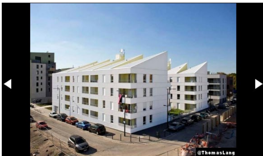
43 logements à Saint-Denis